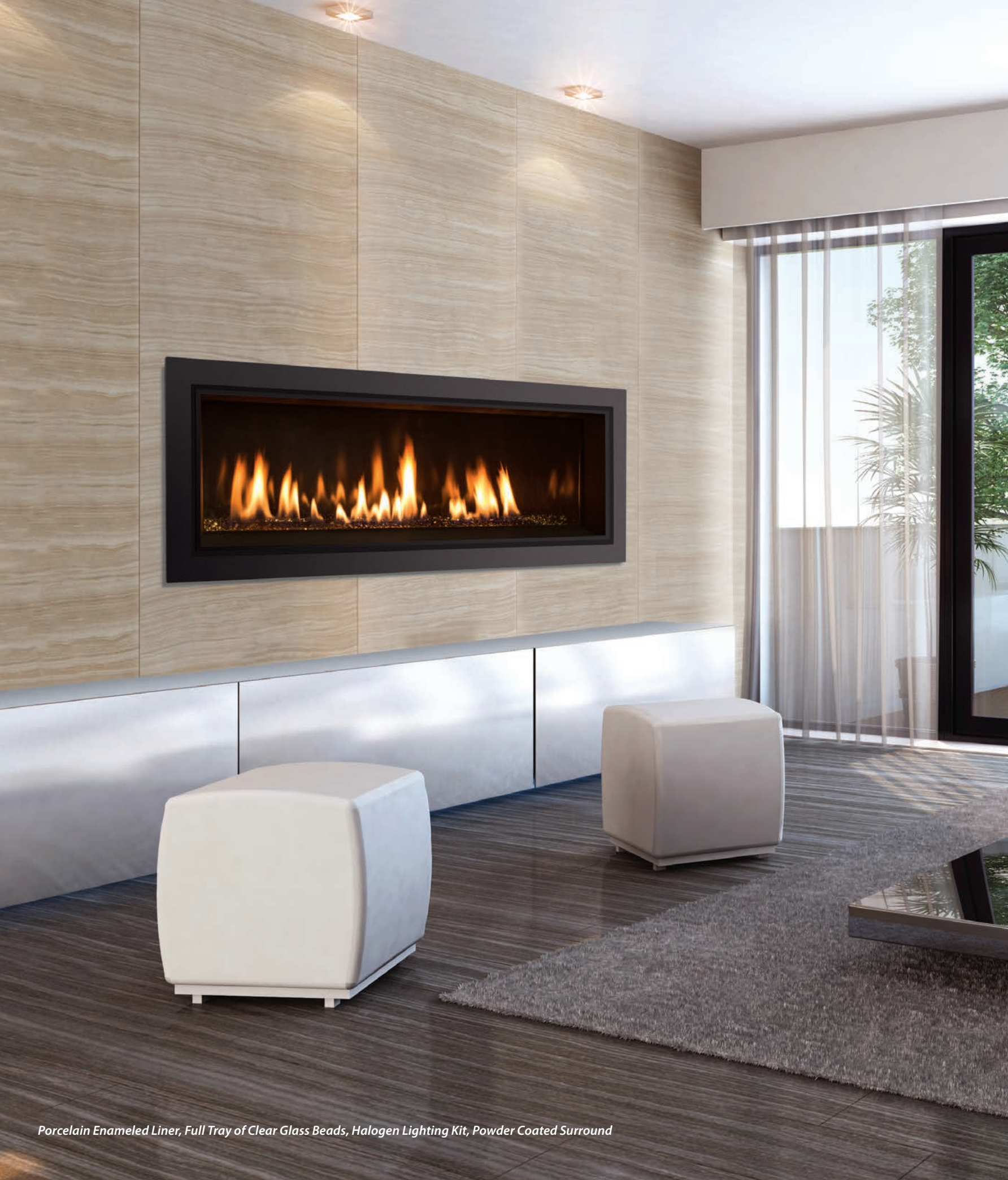
Porcelain Enameled Liner, Full Tray of Clear Glass Beads, Halogen Lighting Kit, Powder Coated Surround