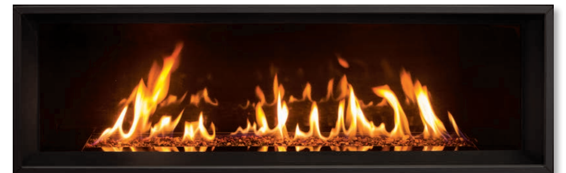
Porcelain Enameled Liner – Glass Bezel