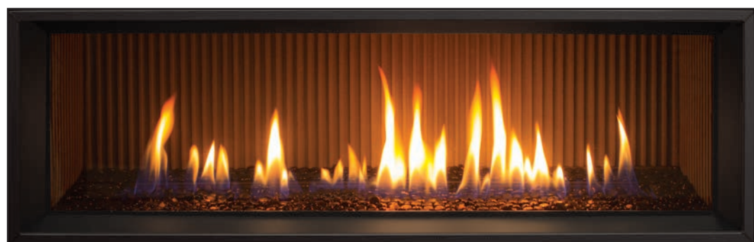
Fluted Liner – Full Glass Tray