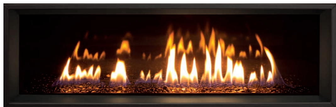
Porcelain Enameled Liner – Full Glass Tray