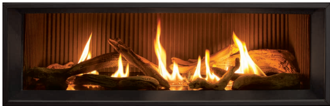
Fluted Liner – Ultra High Definition Log Set