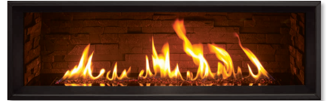
Ledgestone Liner – Glass Bezel