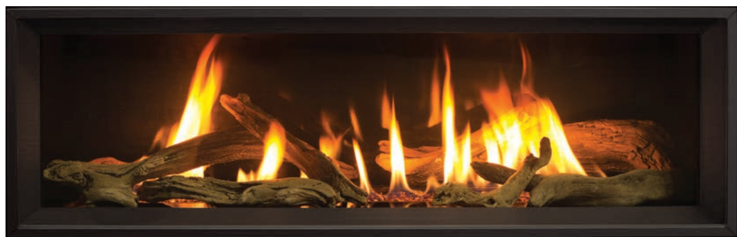
Porcelain Enameled Liner – Ultra High Definition Log Set