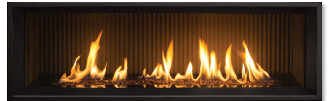
Fluted Liner – Glass Bezel