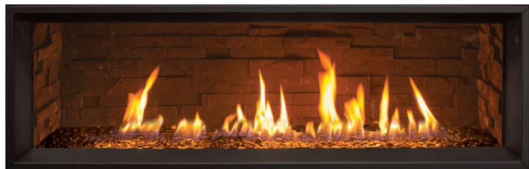
Ledgestone Liner – Full Glass Tray