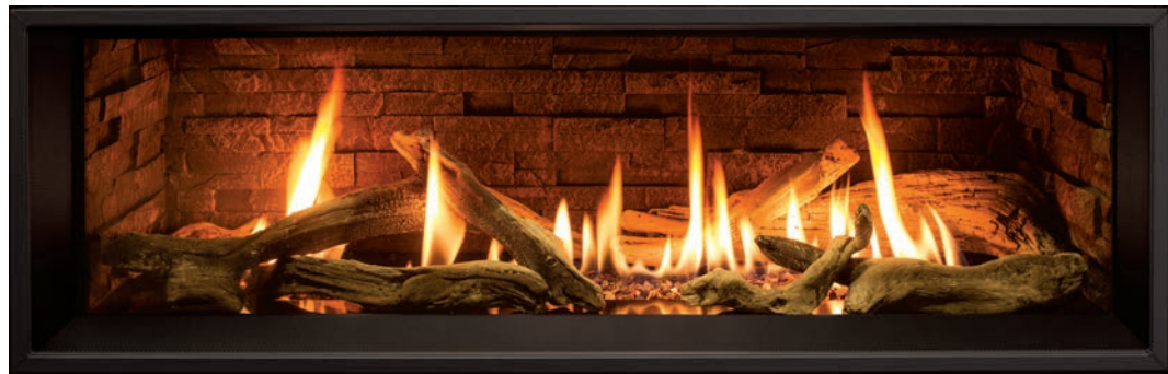
Ledgestone Liner – Ultra High Definition Log Set