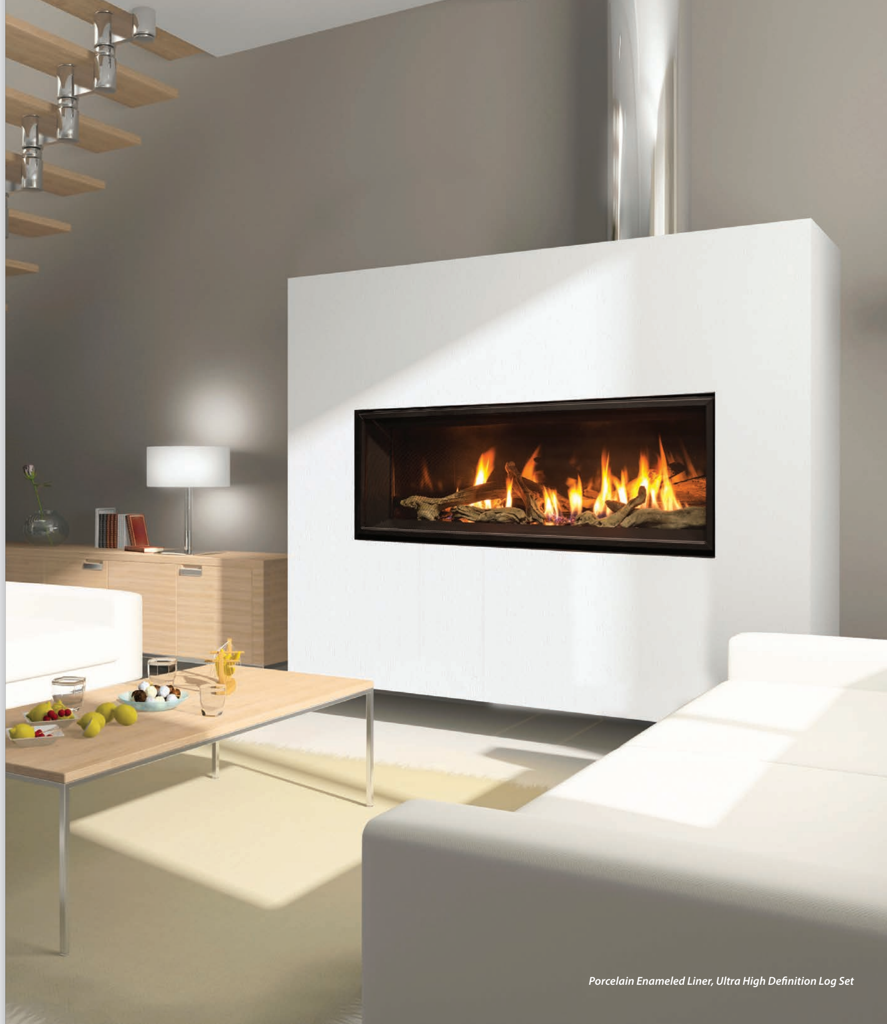
Porcelain Enameled Liner, Ultra High Definition Log Set