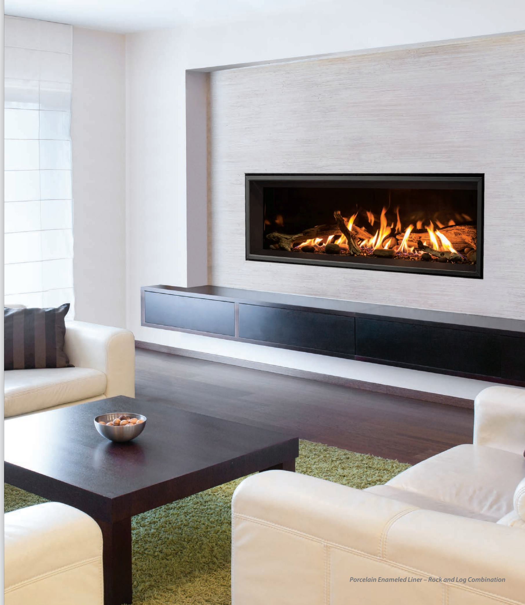
Porcelain Enameled Liner – Rock and Log Combination